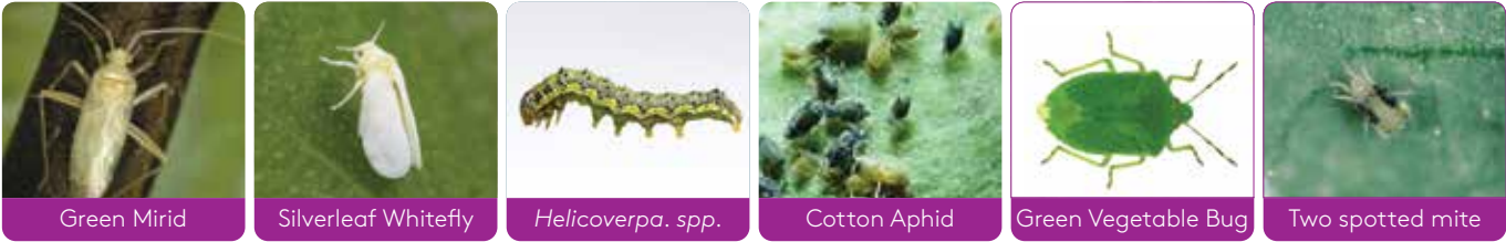
Skope® controls the key insect pests of cotton (Two spotted mite is suppression only).