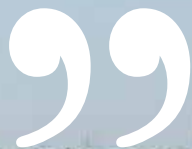
Yang Xingqiang Chairman

Our continued growth across the globe and robust performance in the fourth quarter capped off our strongest year to date. During 2017, we achieved the milestone of becoming the only publically traded, integrated, Global-China crop protection leader. Our recent successful private placement, in which we raised $240m in new equity from key institutional investors, reflects the warm welcome we received from the capital markets, and will be used to support our strategic growth initiatives in the coming years. Our business momentum in recent years, together with our strong foundations and unique positioning in the global and Chinese crop protection markets, provide confidence that we will be able to capitalize on the exciting opportunities that lie ahead.