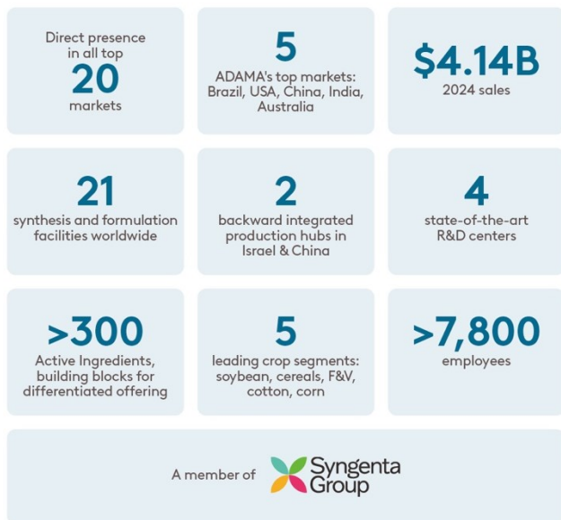
2024 Sales in %

ADAMA's leading Active Ingredient platform, coupled with its formulation technologies, are at the center of the company's product sustainability strategy, enabling the company to quickly bring to market superior products that improve crop yields while limiting their environmental impact, supporting soil health, and safeguarding natural resources.