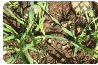
TOWER® (2.0 L/ha)

NO VARIETAL RESTRICTIONS – TOWER® can be applied pre- or post-emergence to all currently grown commercial varieties of winter and spring wheat, winter and spring barley, winter rye and winter triticale.