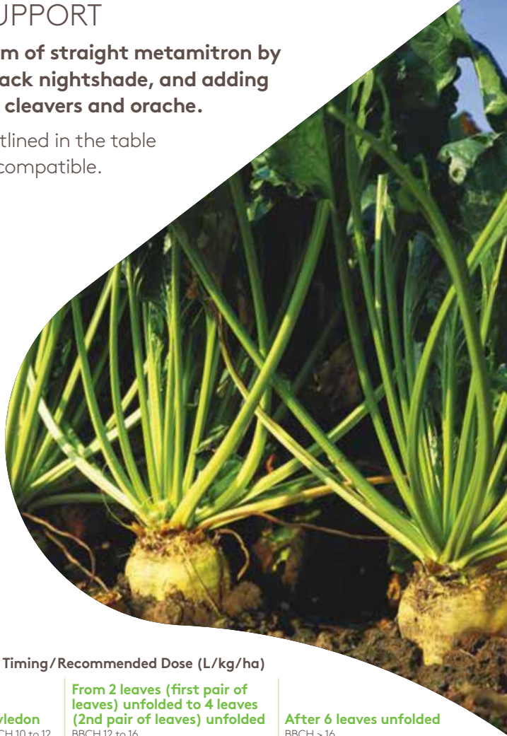
Application Timing / Recommended Dose (L/kg/ha)