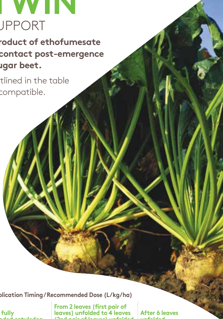
Application Timing / Recommended Dose (L/kg/ha)