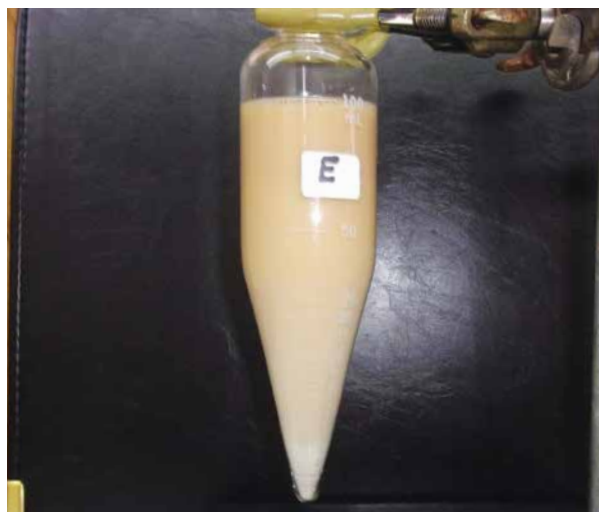
Extruded formulation of metribuzin in solution one hour after mixing